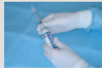
Push while rotating