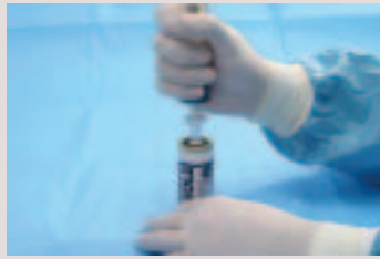
Connect. Push while rotating.