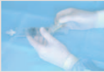
Remove the needle and open its pouch push the plunger back.