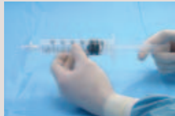
Air intake through the validated filter.