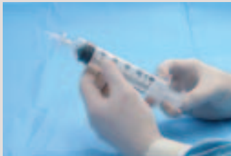
Only keep the required volume.