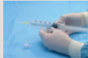
Remove the filter and fit the needle, keeping the cap on until the injection.