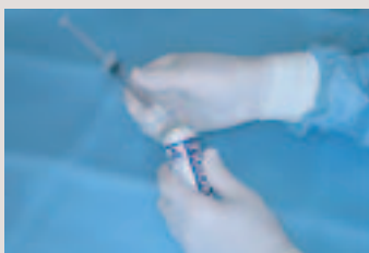
Disconnect, using a left