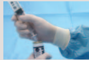
Disconnect, using a right-left movement.