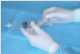
Remove the needle and open its pouch